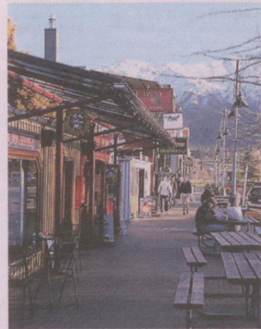
Good-natured rivals ... a quiet Wanaka street; (top) the idyllic setting of Queenstown.

Sue White travelled courtesy of Tourism NZ.