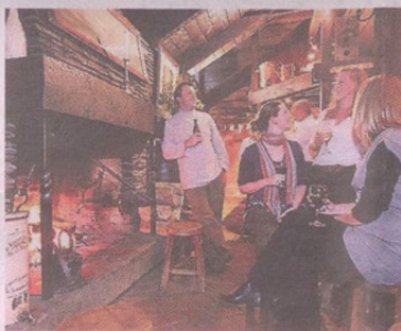
Sip and ski... Queenstown's nightlife is legendary; (right) Wanaka's Treble Cone is the South Island's largest ski area.

Can't ski? Strap-on snowshoes allow the old, the young and the uncoordinated to float across knee-deep snow with ease.